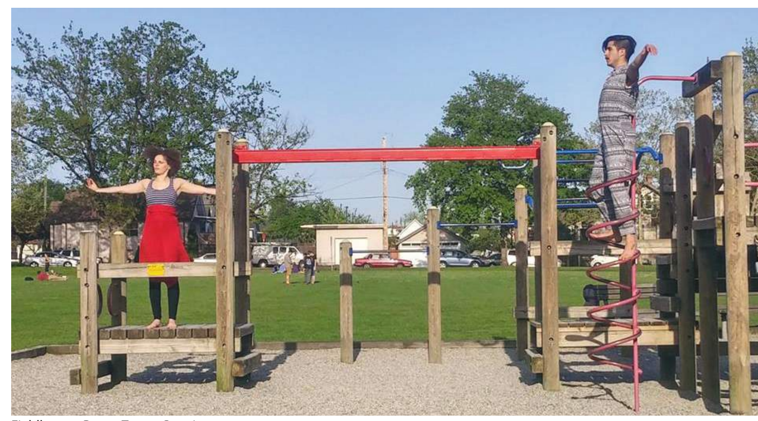
Fieldhouse, Dance Troupe Practice.