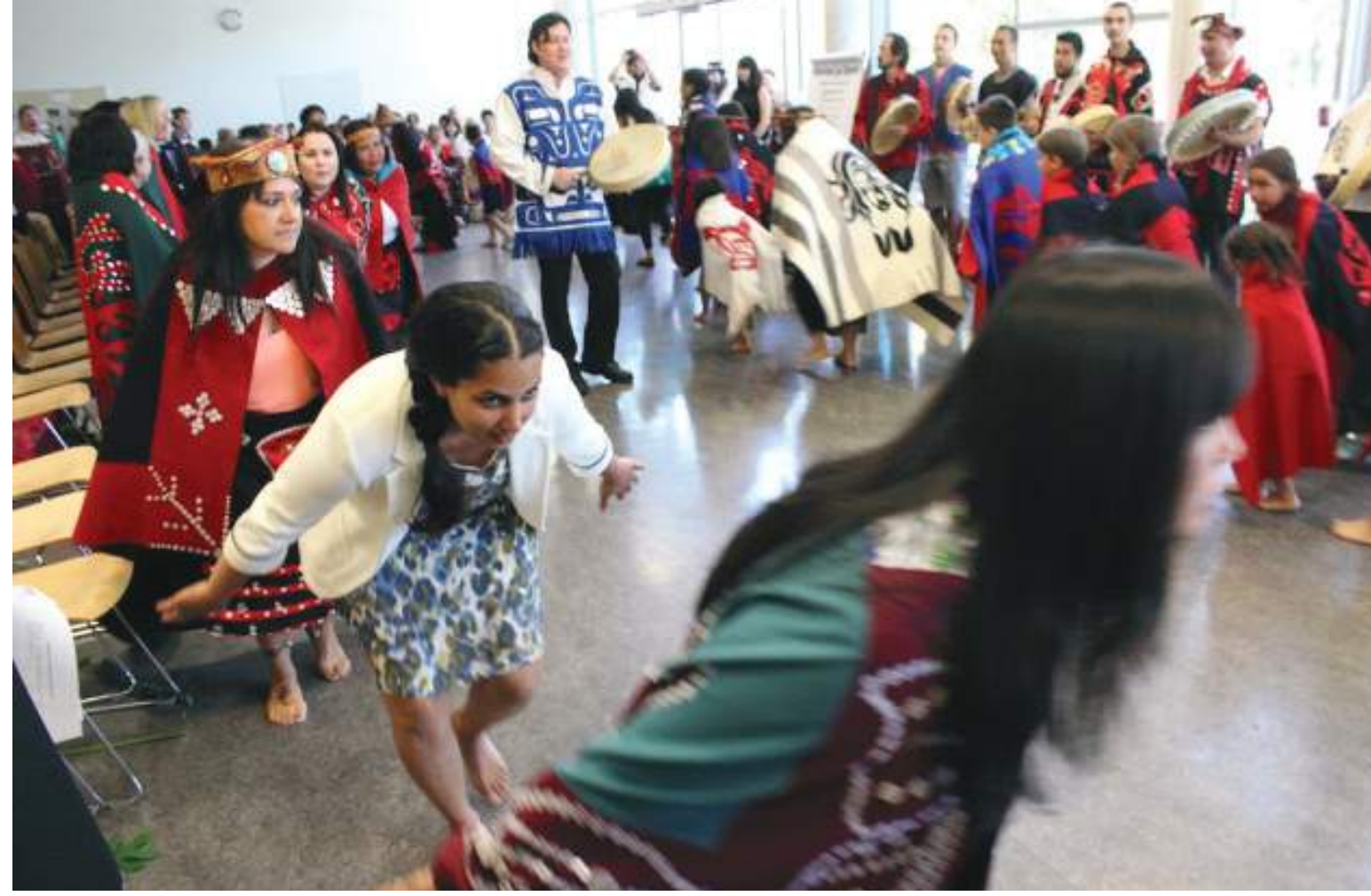
CEA, Songs for Reconciliation.