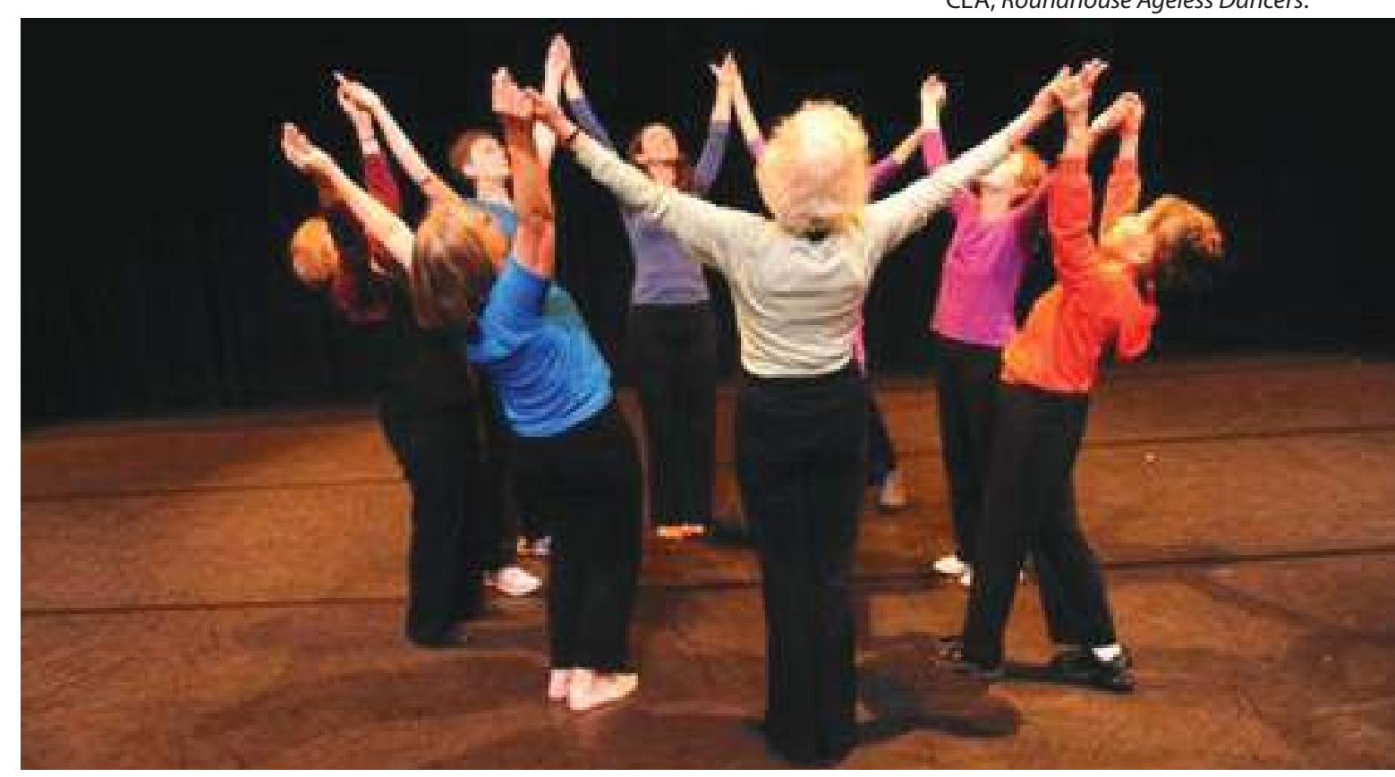
CEA, Roundhouse Ageless Dancers.