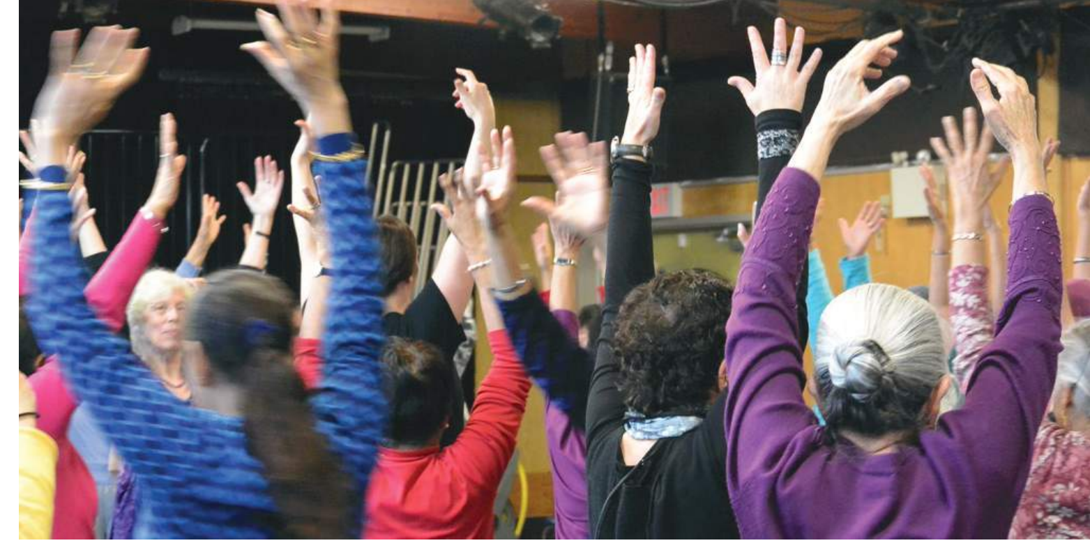
CEA, Arts and Health.