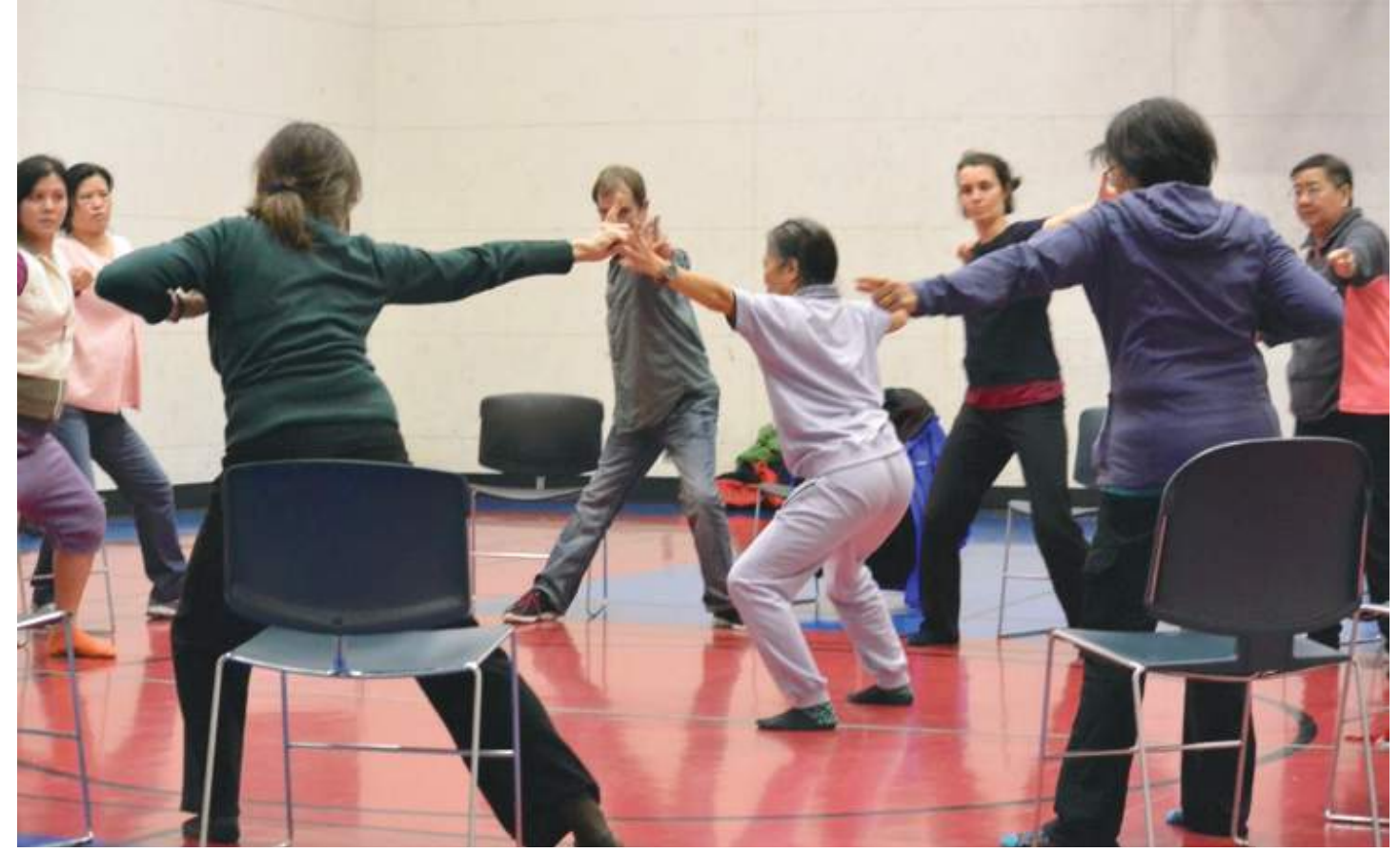
CEA, Carnegie Dancers.

The piece as it grows is inspired by what happens in the room. We're really evolving and growing with the piece. I feel like I'm getting an insider's look at how art gets made. And not just seeing that, being a part of it—every little bit, every member in the group is contributing to making art. It takes on its own life. (participant, Roundhouse Community Dancers )